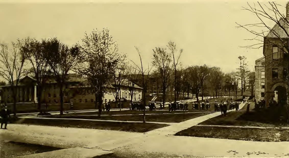
GOLDWIN SMITH HALL